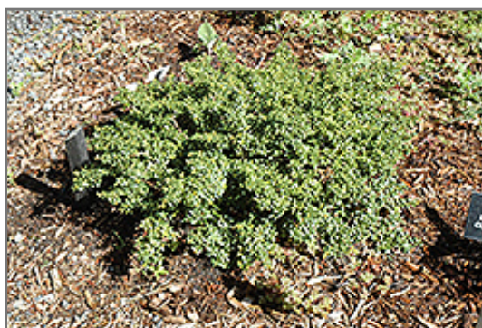
Lemon Gem Dwarf Japanese Holly