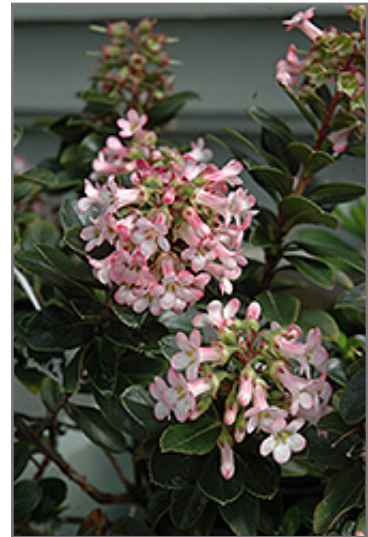
Pink Princess Escallonia flowers