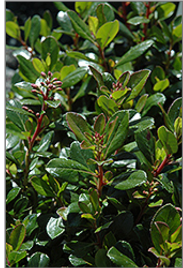
Pink Princess Escallonia foliage

This shrub does best in full sun to partial shade. It does best in average to evenly moist conditions, but will not tolerate standing water. It is not particular as to soil type or pH, and is able to handle environmental salt. It is somewhat tolerant of urban pollution. This particular variety is an interspecific hybrid.