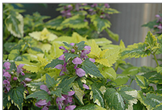
Anne Greenaway Spotted Dead Nettle flowers