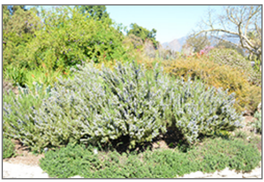
Blue Spires Rosemary in bloom