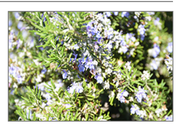
Blue Spires Rosemary flowers