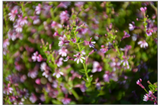
Fairy Dust Pink Cuphea flowers

Fairy Dust Pink Cuphea is recommended for the following landscape applications;