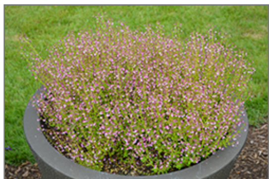
Fairy Dust Pink Cuphea in bloom