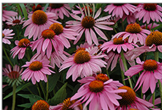
Magnus Coneflower flowers

Magnus Coneflower is recommended for the following landscape applications;