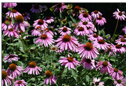
Magnus Coneflower flowers