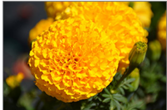
Taishan Gold Marigold flowers