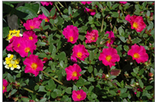
Mojave Fuchsia Portulaca flowers