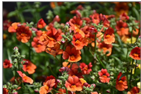
Sunsatia Blood Orange Nemesis flowers