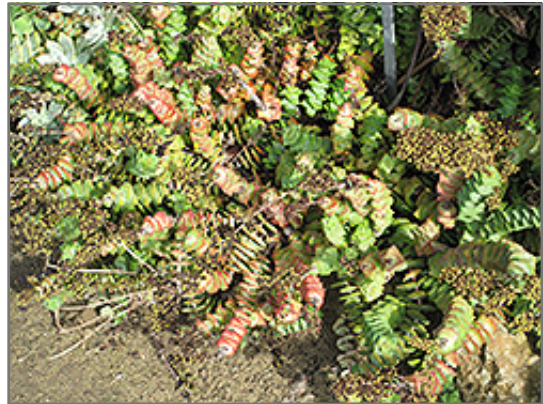
String Of Buttons