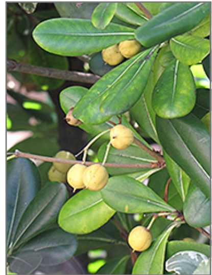
Wheeler's Dwarf Mock Orange fruit

This shrub does best in full sun to partial shade. It does best in average to evenly moist conditions, but will not tolerate standing water. It is not particular as to soil type or pH. It is somewhat tolerant of urban pollution. This is a selected variety of a species not originally from North America.