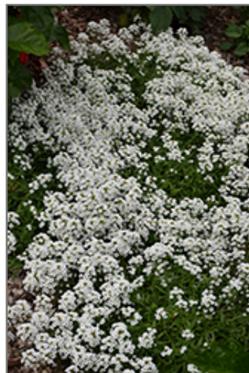
Stream White Sweet Alyssum in bloom