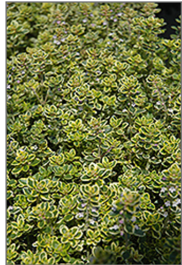
Lemon Thyme foliage

Lemon Thyme is smothered in stunning spikes of lilac purple flowers rising above the foliage from early to late summer. Its attractive tiny fragrant round leaves remain light green in color throughout the year.