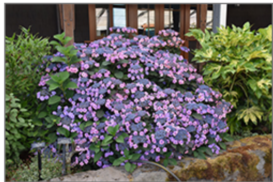
Tuff Stuff Hydrangea in bloom