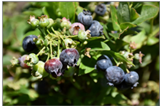
Jelly Bean Blueberry fruit