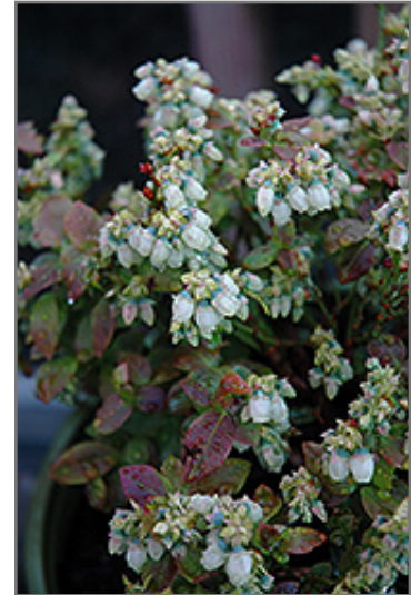
Jelly Bean Blueberry flowers

Jelly Bean Blueberry is a good choice for the edible garden, but it is also well-suited for use in outdoor pots and containers. It can be used either as 'filler' or as a 'thriller' in the 'spiller-thriller-filler' container combination, depending on the height and form of the other plants used in the container planting. It is even sizeable enough that it can be grown alone in a suitable container. Note that when grown in a container, it may not perform exactly as indicated on the tag - this is to be expected. Also note that when growing plants in outdoor containers and baskets, they may require more frequent waterings than they would in the yard or garden.