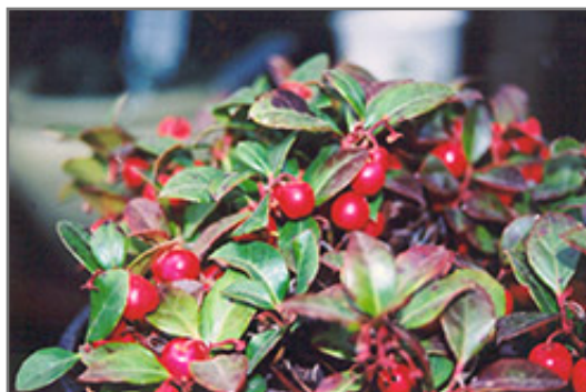
Creeping Wintergreen fruit