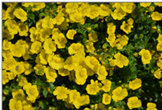
Gold Dust Mecardonia flowers