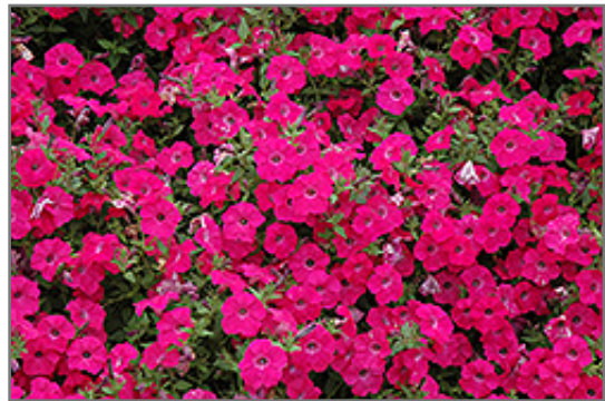
Tidal Wave Hot Pink Petunia in bloom