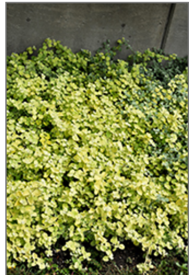
Lemon Licorice Plant