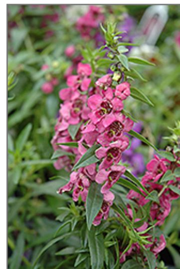
Pink Angelonia flowers