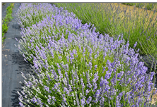
Blue Cushion Lavender in bloom