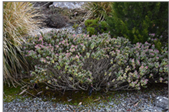
Silver Dollar Hebe