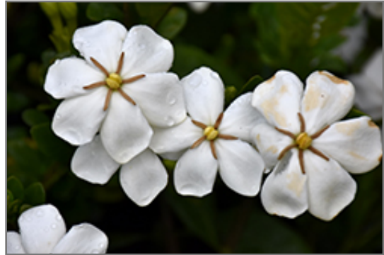
Kleim's Hardy Gardenia flowers

Kleim's Hardy Gardenia will grow to be about 3 feet tall at maturity, with a spread of 3 feet. It has a low canopy. It grows at a slow rate, and under ideal conditions can be expected to live for approximately 30 years.