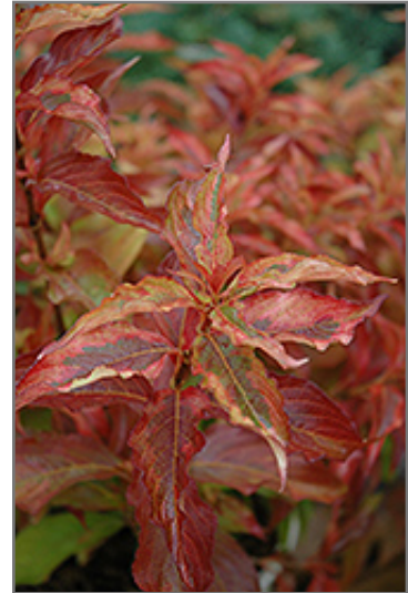
My Monet Sunset Weigela in fall

My Monet Sunset Weigela makes a fine choice for the outdoor landscape, but it is also well-suited for use in outdoor pots and containers. It is often used as a 'filler' in the 'spiller-thriller-filler' container combination, providing a mass of flowers and foliage against which the thriller plants stand out. Note that when grown in a container, it may not perform exactly as indicated on the tag - this is to be expected. Also note that when growing plants in outdoor containers and baskets, they may require more frequent waterings than they would in the yard or garden.