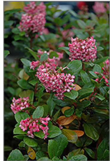
Newport Dwarf Escallonia flowers