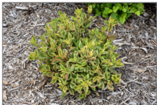
Rainbow Sensation Weigela