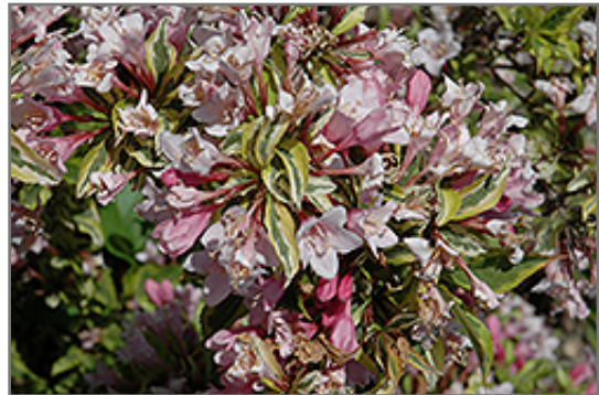
Rainbow Sensation Weigela flowers