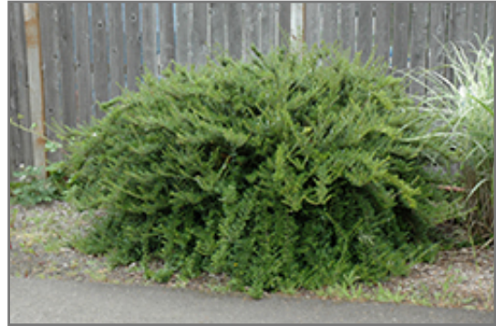
Box Honeysuckle

Box Honeysuckle is recommended for the following landscape applications;