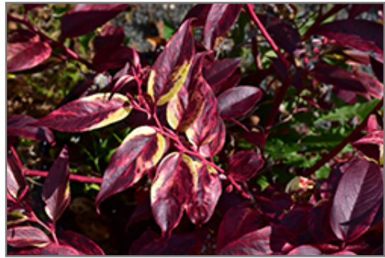
Rainbow Fetterbush in fall

Rainbow Fetterbush will grow to be about 5 feet tall at maturity, with a spread of 6 feet. It tends to fill out right to the ground and therefore doesn't necessarily require facer plants in front, and is suitable for planting under power lines. It grows at a medium rate, and under ideal conditions can be expected to live for approximately 20 years.