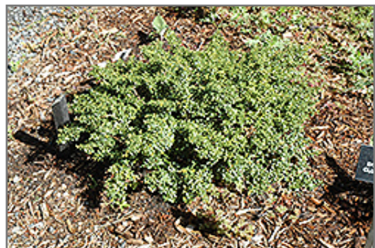
Lemon Gem Dwarf Japanese Holly