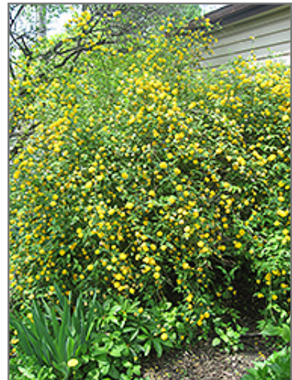
Double Flowered Japanese Kerria