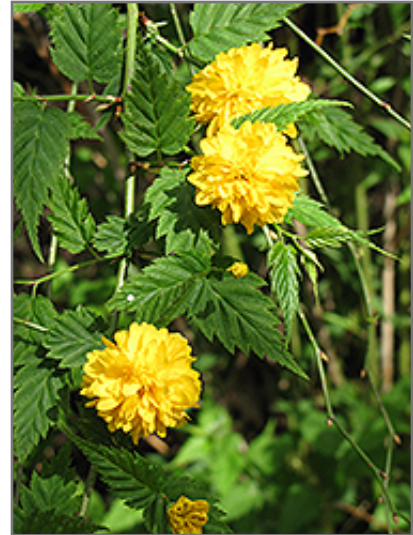
Double Flowered Japanese Kerria flowers