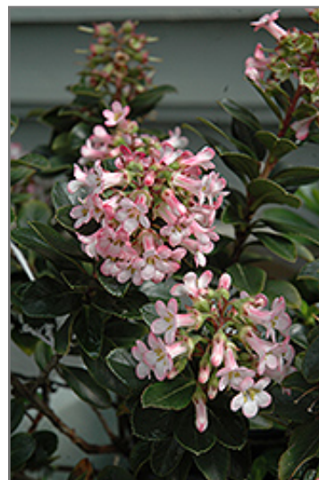
Pink Princess Escallonia flowers