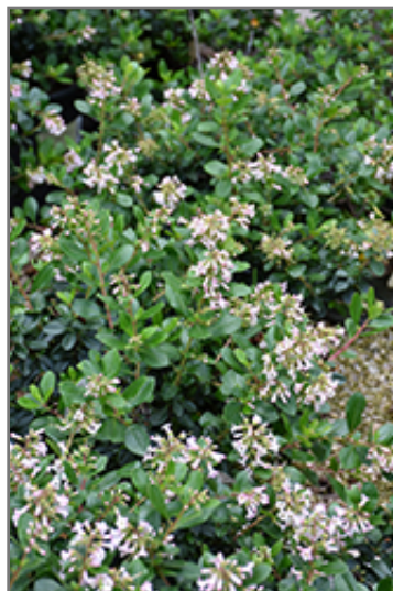
Pink Princess Escallonia in bloom