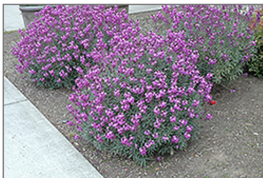
Bowles Mauve Wallflower in bloom