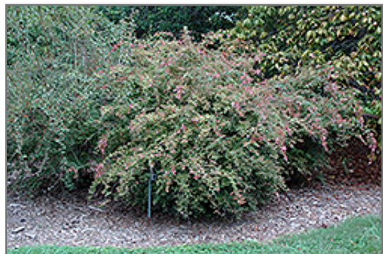
Edward Goucher Abelia in bloom