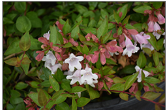
Edward Goucher Abelia flowers

Edward Goucher Abelia is recommended for the following landscape applications;