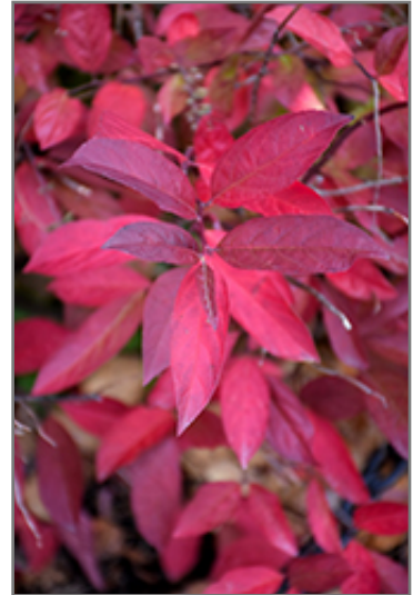
Henry's Garnet Virginia Sweetspire in fall

This shrub performs well in both full sun and full shade. It is an amazingly adaptable plant, tolerating both dry conditions and even some standing water. It is not particular as to soil type or pH. It is somewhat tolerant of urban pollution. This is a selection of a native North American species.