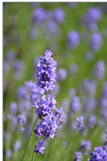
Hidcote Blue Lavender flowers