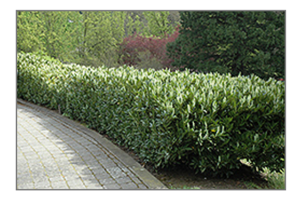
Schipka Cherry Laurel in bloom