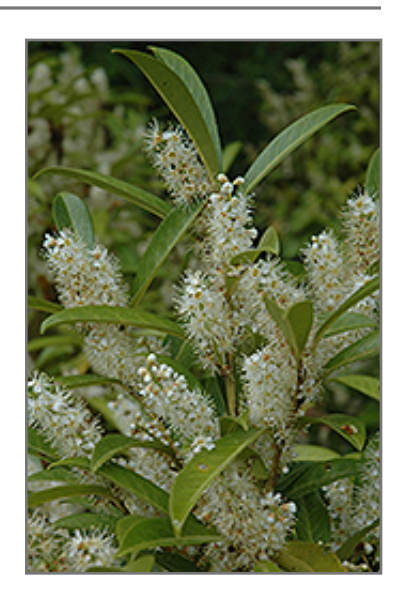
Schipka Cherry Laurel flowers