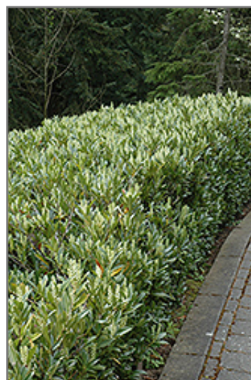
Otto Luyken Dwarf Cherry Laurel in bloom