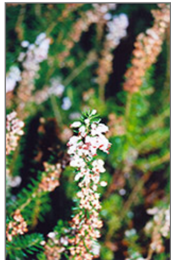
Scotch Heather flowers