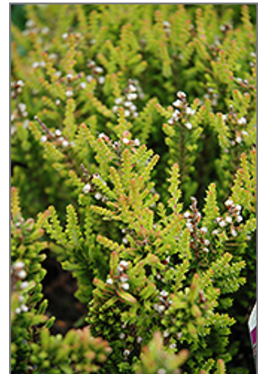
Firefly Heather foliage