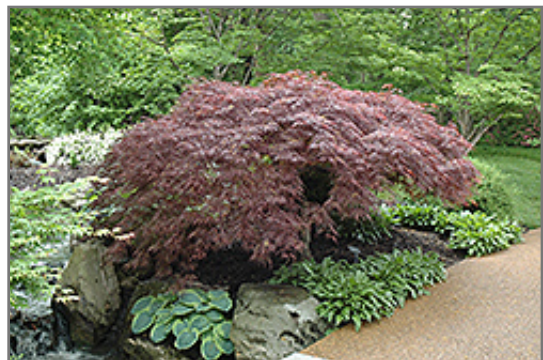
Red Select Japanese Maple