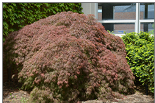
Red Select Japanese Maple