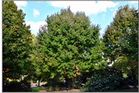
Autumn Flame Red Maple

This tree should only be grown in full sunlight. It is quite adaptable, preferring to grow in average to wet conditions, and will even tolerate some standing water. It is not particular as to soil type, but has a definite preference for acidic soils, and is subject to chlorosis (yellowing) of the foliage in alkaline soils. It is somewhat tolerant of urban pollution. This is a selection of a native North American species.