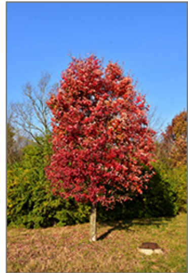
Autumn Flame Red Maple in fall