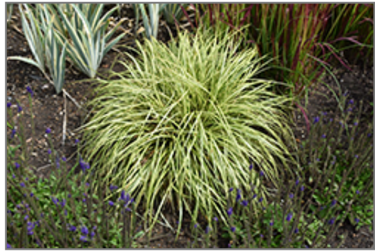
Evergold Variegated Japanese Sedge foliage

Evergold Variegated Japanese Sedge will grow to be about 8 inches tall at maturity, with a spread of 12 inches. Its foliage tends to remain low and dense right to the ground. It grows at a medium rate, and under ideal conditions can be expected to live for approximately 10 years. As an evergreen perennial, this plant will typically keep its form and foliage year-round.