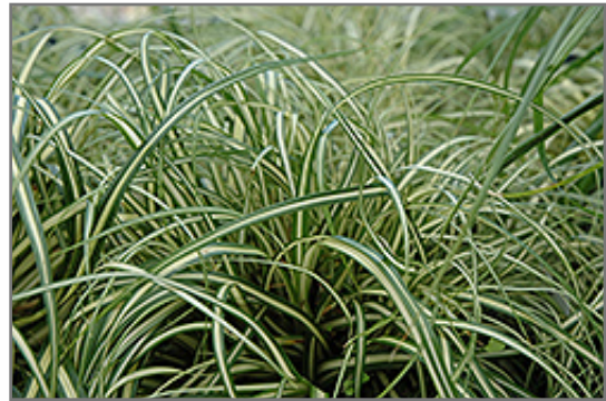
Evergold Variegated Japanese Sedge foliage

Evergold Variegated Japanese Sedge is recommended for the following landscape applications;