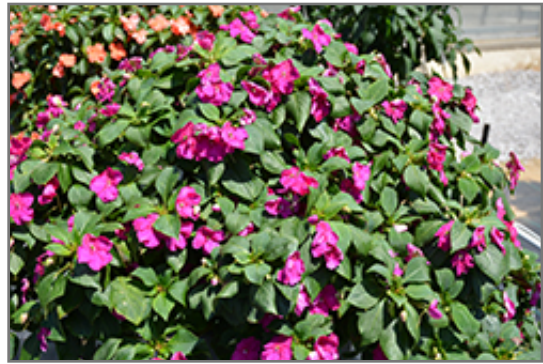
Beacon Violet Shades Impatiens in bloom

Beacon Violet Shades Impatiens will grow to be about 15 inches tall at maturity, with a spread of 12 inches. When grown in masses or used as a bedding plant, individual plants should be spaced approximately 8 inches apart. Its foliage tends to remain dense right to the ground, not requiring facer plants in front. This fast-growing annual will normally live for one full growing season, needing replacement the following year.