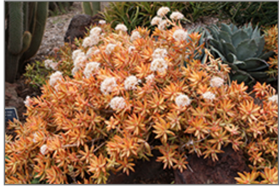
Firestorm Stonecrop in bloom

Firestorm Stonecrop is recommended for the following landscape applications;