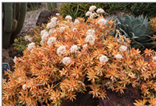
Firestorm Stonecrop in bloom

Firestorm Stonecrop is recommended for the following landscape applications;