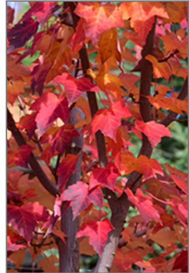
Prairie Rouge Red Maple in fall