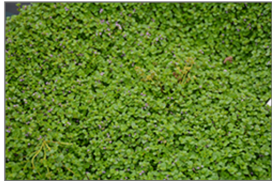
Mini Mint Ornamental Mint

Mini Mint Ornamental Mint is recommended for the following landscape applications;