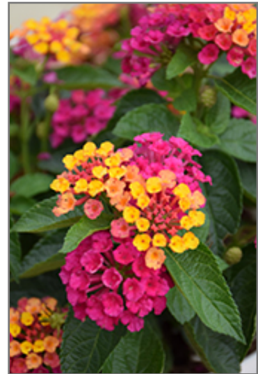
Luscious Royale Cosmo Lantana flowers

Luscious Royale Cosmo Lantana is recommended for the following landscape applications;