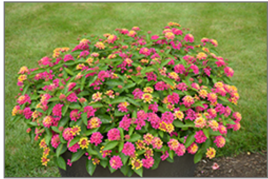
Luscious Royale Cosmo Lantana in bloom

Luscious Royale Cosmo Lantana will grow to be about 18 inches tall at maturity, with a spread of 24 inches. When grown in masses or used as a bedding plant, individual plants should be spaced approximately 18 inches apart. It has a low canopy. It grows at a fast rate, and under ideal conditions can be expected to live for approximately 20 years.