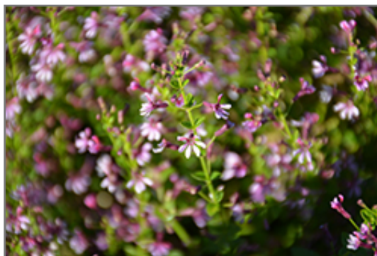
Fairy Dust Pink Cuphea flowers

Fairy Dust Pink Cuphea is recommended for the following landscape applications;