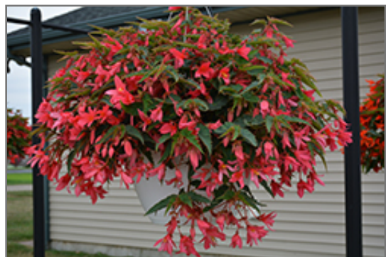
Bossa Nova Pink Glow Begonia in bloom