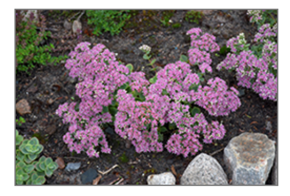
Lime Twister Stonecrop in bloom