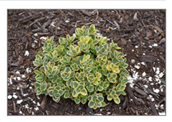
Lime Twister Stonecrop

Lime Twister Stonecrop will grow to be only 4 inches tall at maturity extending to 6 inches tall with the flowers, with a spread of 18 inches. When grown in masses or used as a bedding plant, individual plants should be spaced approximately 15 inches apart. Its foliage tends to remain low and dense right to the ground. It grows at a fast rate, and under ideal conditions can be expected to live for approximately 15 years. As an herbaceous perennial, this plant will usually die back to the crown each winter, and will regrow from the base each spring. Be careful not to disturb the crown in late winter when it may not be readily seen!